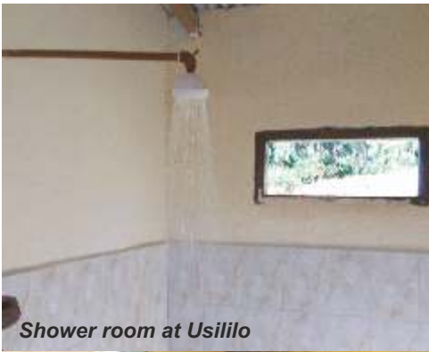
Shower room at Usililo