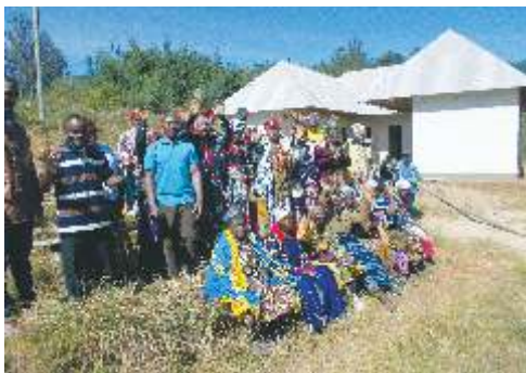
Cheerful villagers in front of the Dispensary they've built

walls and floors and putting in windows and doors. The community