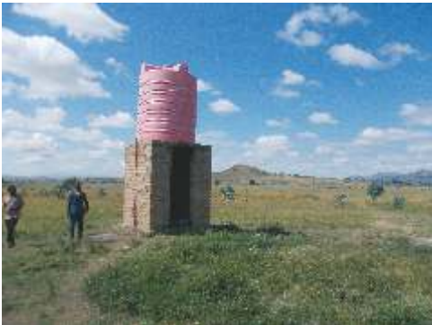
... we are pleased to report in 2021 that the work is complete

specially built tower and laid pipes around the school to a new tap adjacent to the girls' dormitory which the girls are very pleased about.