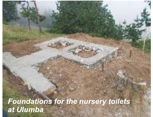
Foundations for the nursery toilets at Ulumba

teachers' toilets at Mahulu Primary are now finished, following the provision of paint, and work on the kitchen at Katenga Primary continued. At Ulumba Primary, money