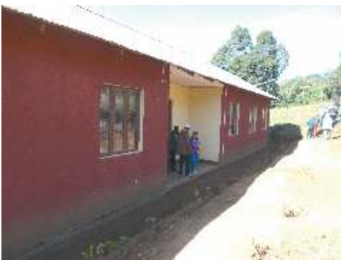
Outside Usililo dormitory

either of these locations, at least the girls in both schools have more comfortable sleeping and living arrangements now.