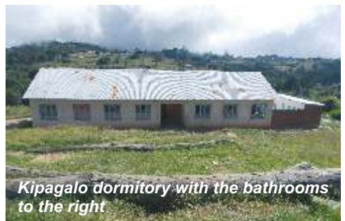
Kipagalo dormitory with the bathrooms to the right

At secondary school level, work continued on the girls' dormitory bathrooms at Kipagalo (painting) and Usililo (building still). Usililo has received a quantity of mattresses for the girls too. While these sanitary arrangements are not completed at