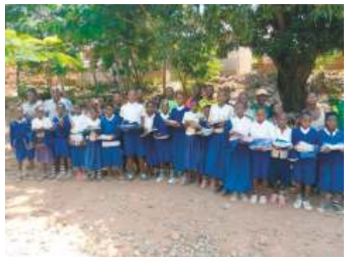
Pupils at Kala Primary School

We have also supported girls at Mkwamba and Mkole Secondary Schools with grants for food each term.