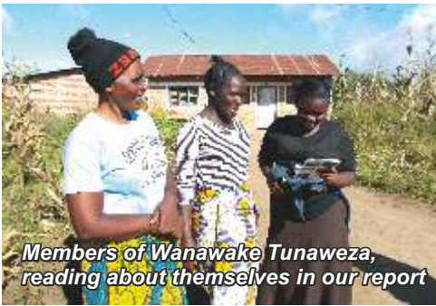
Members of Wanawake Tunaweza, reading about themselves in our report

In Madihani village work has continued on improving the school's water supply with a knock on effect for the village itself. Repairs to one of the classrooms are completed. The