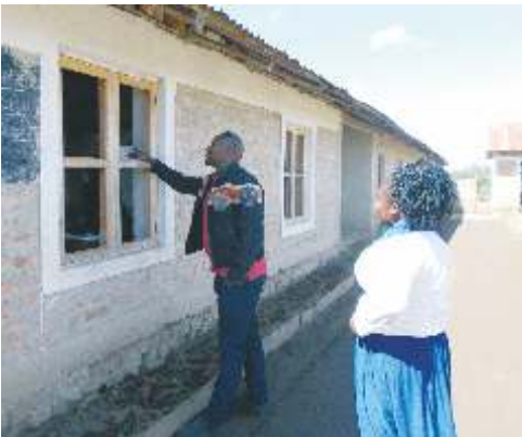
Inspecting new window frames for a Madihani Classroom and below, the Teachers' toilets now in use at Muhulu

In Madihani village work has continued on improving the school's water supply with a knock on effect for the village itself. Repairs to one of the classrooms are completed. The