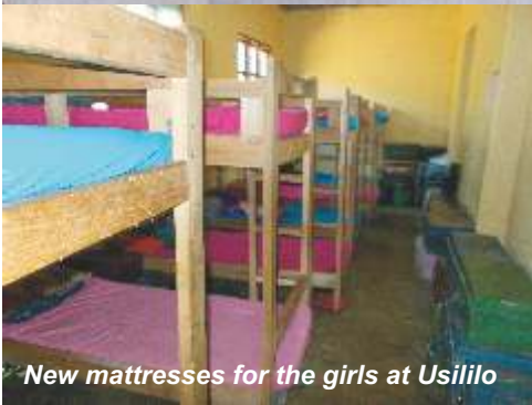
New mattresses for the girls at Usililo

either of these locations, at least the girls in both schools have more comfortable sleeping and living arrangements now.